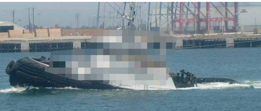
Fig. 2 - Tug with low freeboard engaged unsafely in escort work, burying its deck to an extreme

The ability of tugs with omni-directional drives to bury their decks during high-speed turns is another phenomenon which requires careful design assessment. It is quite probable that this was a major cause of the recent tug sinking in China. The fact that tugs can develop sufficient forces to put themselves in precarious positions such as that illustrated in Fig. 3 (above) suggests the need for a careful assessment of the dynamic forces involved in such a turn as part of the basic design process. At Robert Allan Ltd. we have long recognized the risk of such tug behavior and in general our hull forms are configured to develop lifting forces during lateral movements. Unfortunately this is not a universal trait. Wall-sided hull forms