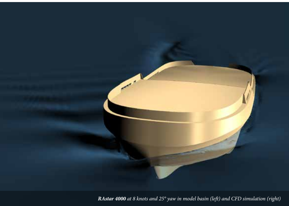
RAstar 4000 at 8 knots and 25° yaw in model basin (left) and CFD simulation (right)