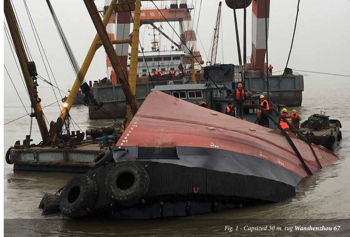
Fig. 1 - Capsized 30 m. tug Wanshenzhou 67