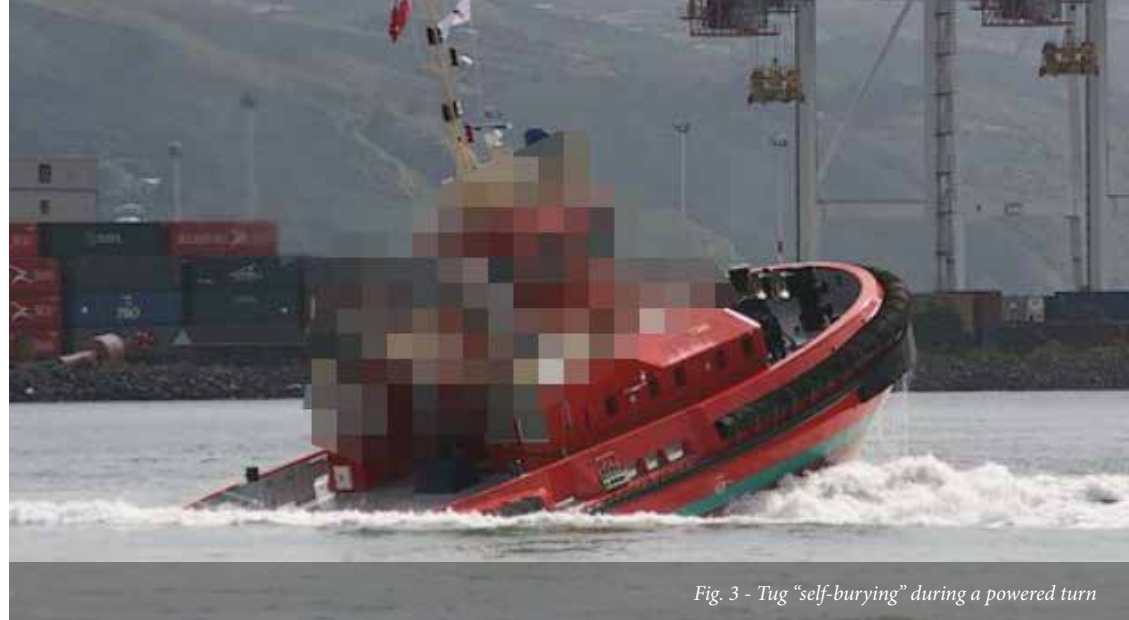
Fig. 3 - Tug “self-burying” during a powered turn